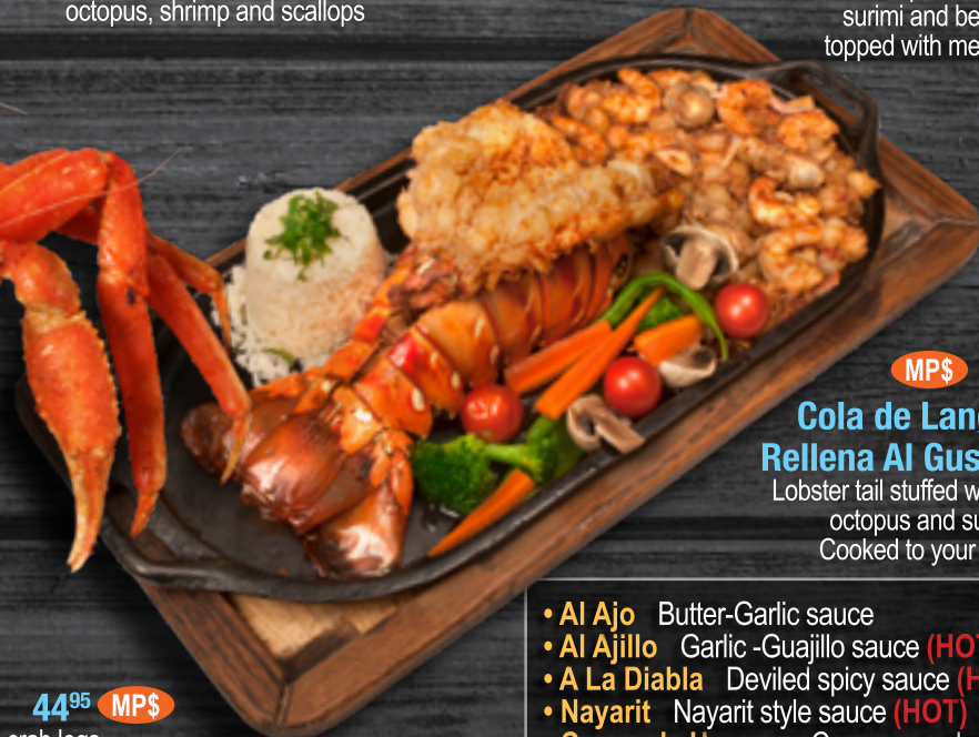
MP$ Cola de Langosta Rellena Al Gusto 89 95 Lobster tail stuffed with shrimp, octopus and surimi. Cooked to your liking: