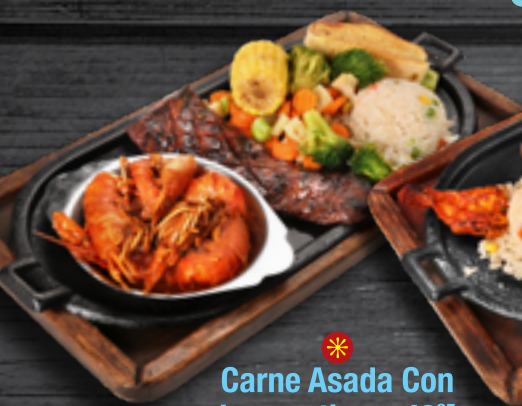
* Carne Asada Con Langostinos 43 95 Skirt steak with prawns Nayarit style