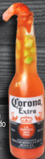
Bombita 6 75