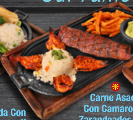
* Carne Asada Con Camarones Zarandeados 45 95 Char-broiled steak with your choice of: grilled shrimp or butter-garlic sauce shrimp