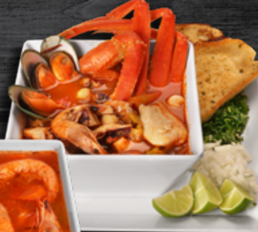
Caldo Siete Mares

* THESE ITEMS ARE COOKED TO ORDER CONSUMING RAW OR UNDERCOOKED MEATS, POULTRY, SEAFOOD, SHELLFISH, OR EGGS MAY INCREASE YOUR RISK OF FOODBORNE ILLNESS, ESPECIALLY IF YOU HAVE CERTAIN MEDICAL CONDITIONS * ESTOS PLATILLOS SON COCINADOS AL TÉRMINO DEL GUSTO DEL CLIENTE CONSUMIR CARNES, AVES, MARISCOS, O HUEVOS CRUDOS O POCO COCIDO PUEDE AUMENTAR SU RIESGO DE ENFERMEDADES TRANSMITIDAS POR ALIMENTOS, ESPECIALMENTE SI TIENE DETERMINADAS CONDICIONES MÉDICAS