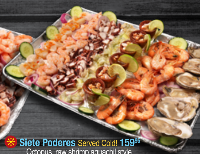
* Siete Poderes Served Cold! 159 95 Octopus, raw shrimp aguachil style, scallops, tuna and boiled shell-on and peeled shrimp, raw oysters, black sauce raw oyster balazos