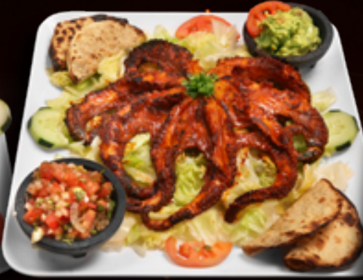
Pulpo Zarandeado 49 95 MP$ Grilled octopus