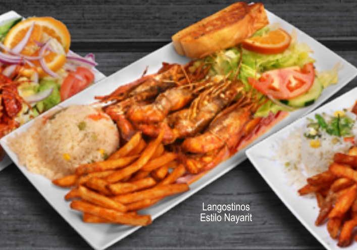
Langostinos Estilo Nayarit