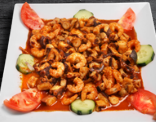
Chapuzón del Mar Sm 39 95 Lg 76 95 MP$ Shrimp, octopus & oysters in our special red mild sauce