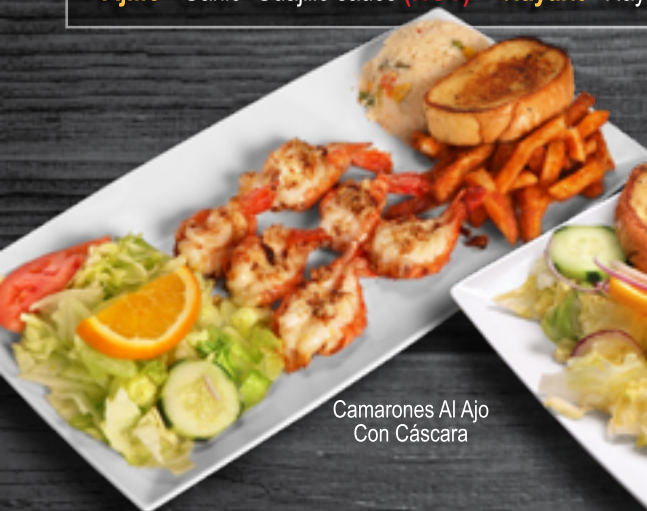
Camarones Al Ajo Con Cáscara