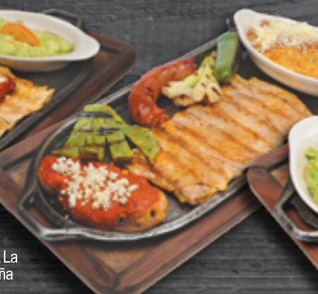
* Pechuga Maguey 32 95 Chicken breast served with grilled nopal-cactus, Mexican sausage and a stuffed Poblano pepper