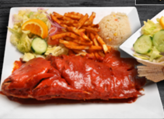
Huachinango A La Diabla

MP$ Prices marked *MP may vary according to the current market. Los precios marcados con *MP pueden variar para ajustarse a los costos en el mercado