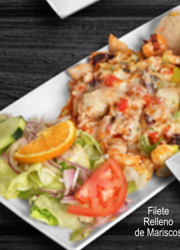
Filete Relleno de Mariscos

Your choice of whole red snapper or tilapia fish, covered with shell-on shrimp and potatoes in our special mix sauce