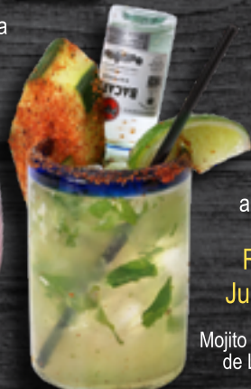
Mojito Especial de Limón