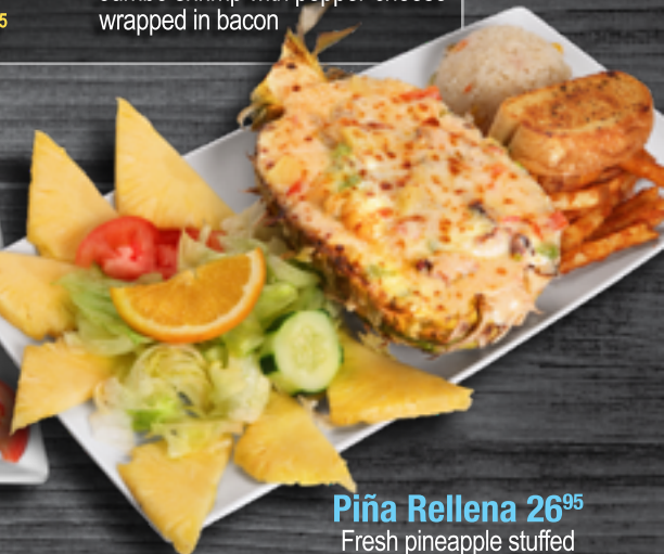
Piña Rellena 26 95 Fresh pineapple stuffed with shrimp, octopus, scallops, surimi and bell peppers topped with melted cheese