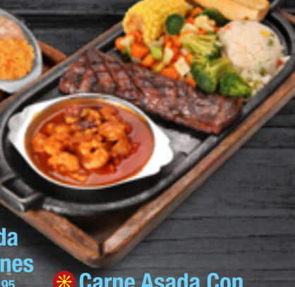
* Carne Asada Con Chapuzón 43 95 Skirt steak with seafood mix Nayarit style (Chapuzón)