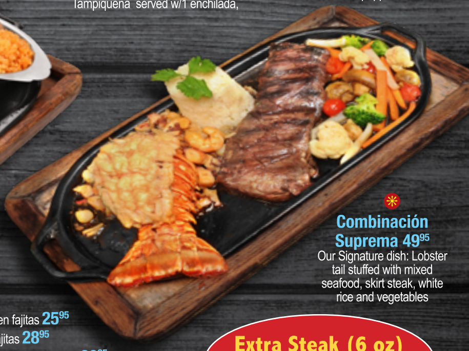
* Combinación Suprema 49 95 Our Signature dish: Lobster tail stuffed with mixed seafood, skirt steak, white rice and vegetables

Extra Steak (6 oz) 6 oz de carne adicional a su platillo: $12