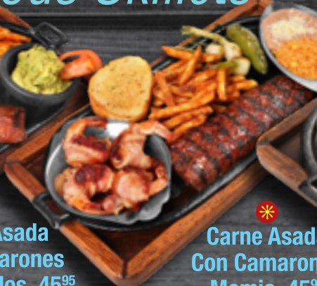
* Carne Asada Con Camarones Momia 45 95 Skirt steak with shrimp wrapped with bacon