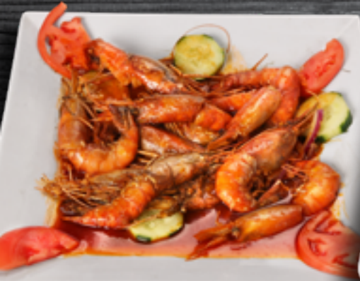
Langostinos Estilo Nayarit Half Tray 34 95 Full Tray 65 95 Jumbo 129 95 MP$ Nayarit style with our house red sauce