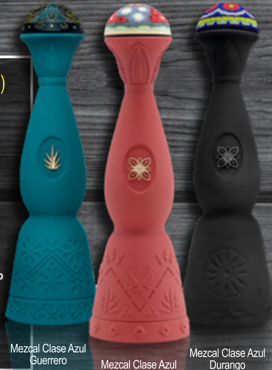
Mezcal Clase Azul Guerrero