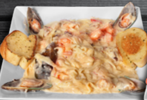
Pasta Maguey 25 95 Creamy spaghetti with shrimp, octopus, scallops and mussels and parmesan cheese