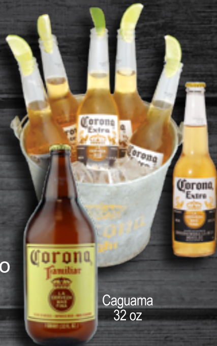
Caguama 32 oz