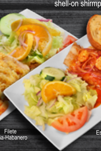
Filete Estilo Nayarit