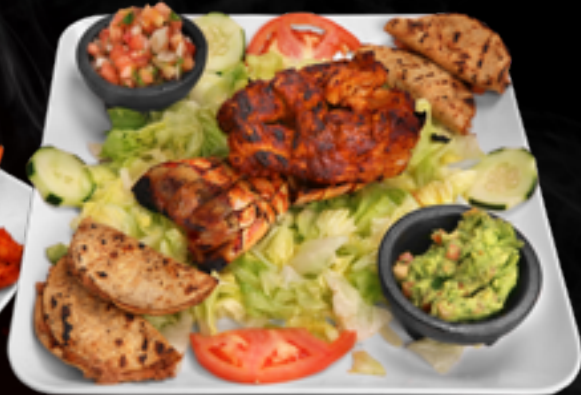
Cola de Langosta Zarandeada 85 95 Grilled lobster tail

Grilled shrimp, choice of zarandeado sauce or garlic sauce