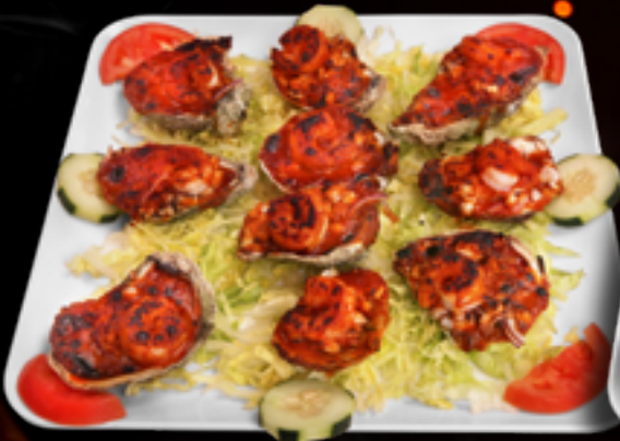
Ostriones Zarandeados (6) 18 95 (12) 35 95 Grilled oysters zarandeado sauce