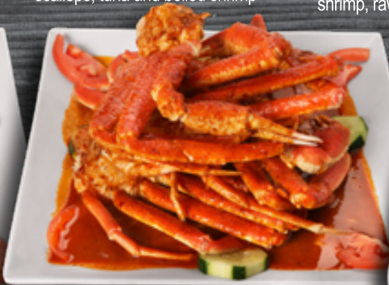
Patas de Jaiba Tray 69 95 Jumbo 149 95 MP$ Crab legs Nayarit style with our house red sauce