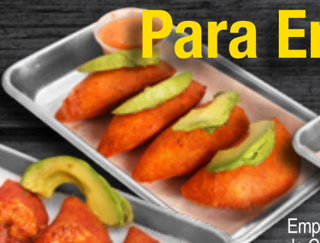
Empanadas de Camarón Regulares