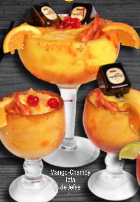
Mango-Chamoy Jefa de Jefas

Where two of the best come together, ice cold beer flipped upside down into our margaritas made with our house tequila