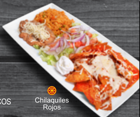
☼ Chilaquiles Rojos

☼ THESE ITEMS ARE COOKED TO ORDER CONSUMING RAW OR UNDERCOOKED MEATS, POULTRY, SEAFOOD, SHELLFISH, OR EGGS MAY INCREASE YOUR RISK OF FOODBORNE ILLNESS, ESPECIALLY IF YOU HAVE CERTAIN MEDICAL CONDITIONS ☼ ESTOS PLATILLOS SON COCINADOS AL TÉRMINO DEL GUSTO DEL CLIENTE CONSUMIR CARNES, AVES, MARISCOS, O HUEVOS CRUDOS O POCO COCIDOS PUEDE AUMENTAR SU RIESGO DE ENFERMEDADES TRANSMITIDAS POR ALIMENTOS, ESPECIALMENTE SI TIENE DETERMINADAS CONDICIONES MEDICAS