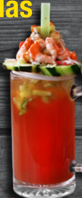
* Michelada Botanera 15 95