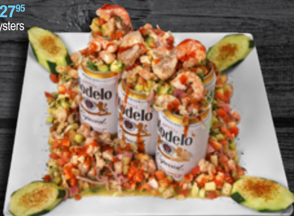
* Seis Loco 54 95