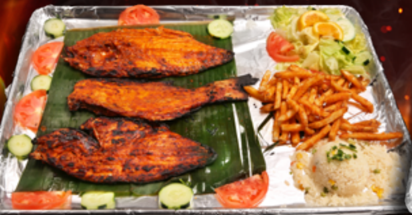
Pescado Zarandeado 52 95 MP$ Grilled whole fish with red sauce

¡DE LO MEJOR DE NUESTRAS ESPECIALIDADES!