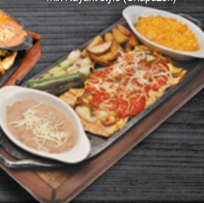
* Pechuga Agave 24 95 Chicken breast w/poblano pepper strips covered with melted cheese and red sauce, served with rice, beans, grilled jalapeño pepper, grilled onions, and fries