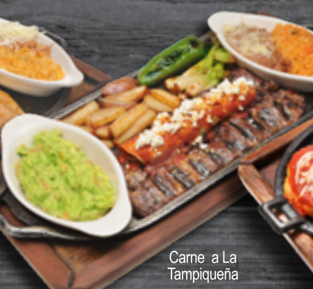
Carne a La Tampiqueña