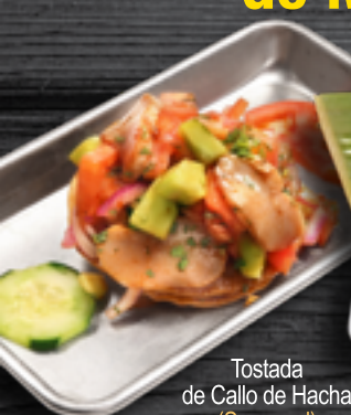
Tostada de Callo de Hacha (Seasonal)