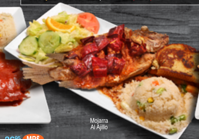
Mojarra Al Ajillo