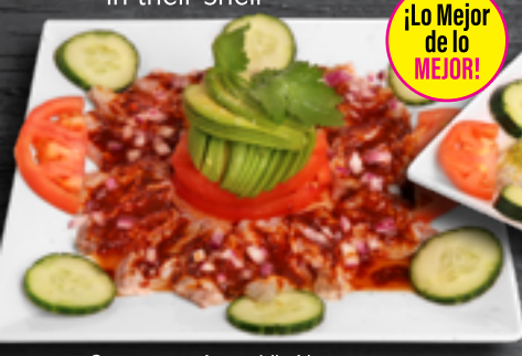
Camarones Aguachile Negros

Raw oysters with our special sauce garnished w/ a shrimp