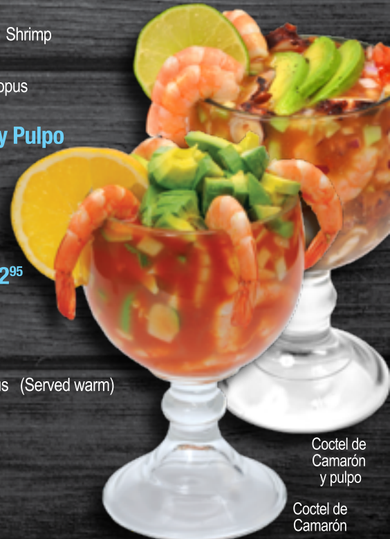
Coctel de Camarón y pulpo

Chopped shrimp and octopus (Served warm)