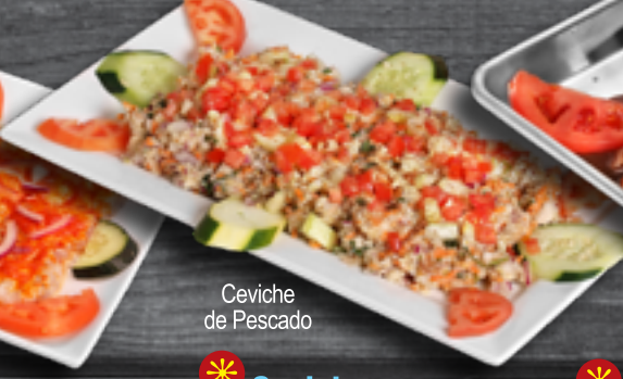
Ceviche de Pescado