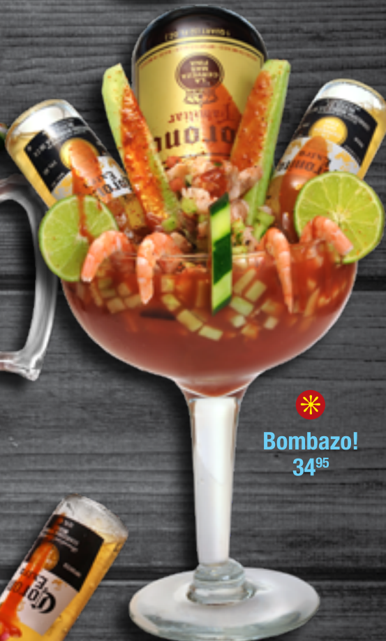
* Bombazo! 34 95