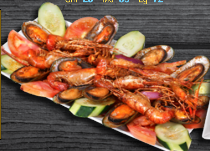
Langostinos Con Mejillones Sm 45 95 Lg 86 95 MP$ Prawns and mussels Nayarit style

* THESE ITEMS ARE COOKED TO ORDER CONSUMING RAW OR UNDERCOOKED MEATS, POULTRY, SEAFOOD, SHELLFISH, OR EGGS MAY INCREASE YOUR RISK OF FOODBORNE ILLNESS, ESPECIALLY IF YOU HAVE CERTAIN MEDICAL CONDITIONS * ESTOS PLATILLOS SON COCINADOS AL TÉRMINO DEL GUSTO DEL CLIENTE CONSUMIR CARNES, AVES, MARISCOS, O HUEVOS CRUDOS O POCO COCIDOS PUEDE AUMENTAR SU RIESGO DE ENFERMEDADES TRANSMITIDAS POR ALIMENTOS, ESPECIALMENTE SI TIENE DETERMINADAS CONDICIONES MÉDICAS