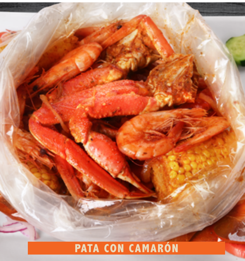
PATA CON CAMARÓN