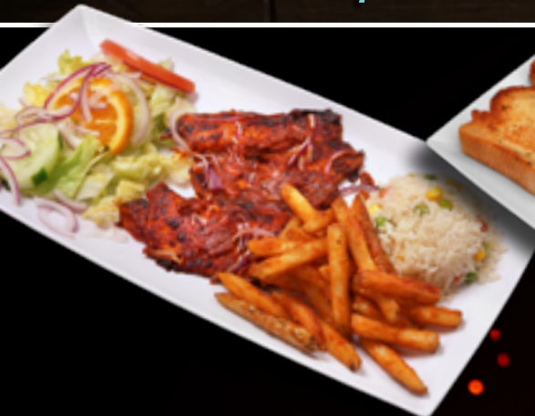
Filete de Mojarra Zarandeada 22 95 Tilapia fillet on the grill Nayarit style

Seafood specialties From Our Grill • Nayarit Style