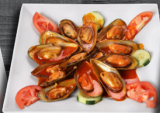
Mejillones Mussels Nayarit style Sm 25 95 Md 39 95 Lg 72 95