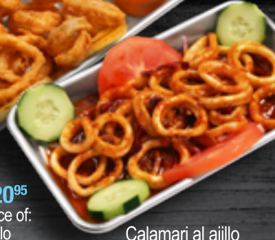
Calamari al ajillo (garlic and guajillo pepper sauce)

Calamari, your choice of: breaded or al ajillo