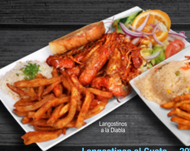
Langostinos a la Diabla