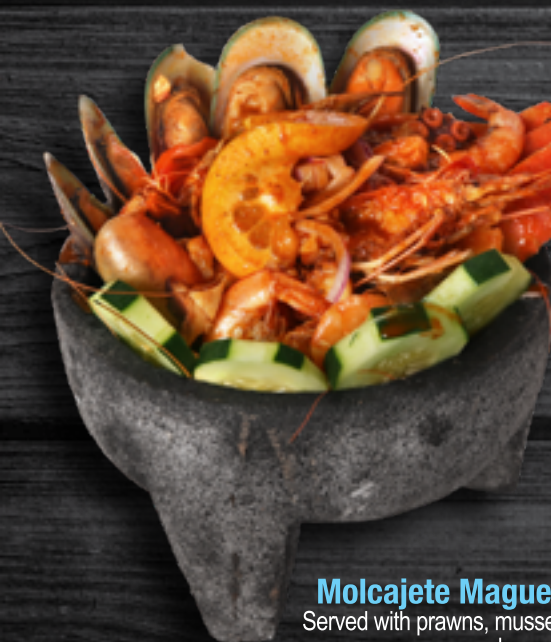
Molcajete Maguey 44 95 MP$ Served with prawns, mussels, crab legs, camarones cucaracha and chapuzón