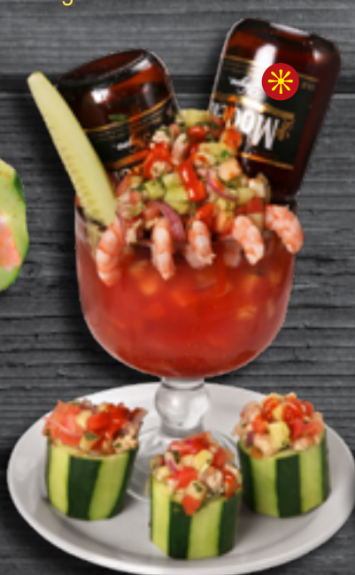
* La Viuda Negra 25 95