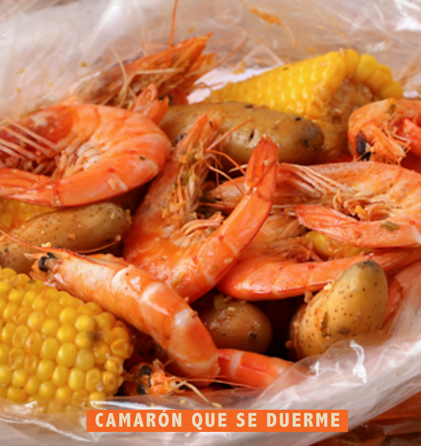
CAMARÓN QUE SE DUERME