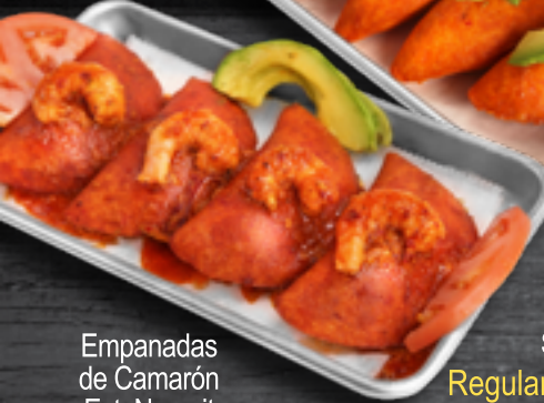
Empanadas de Camarón Est. Nayarit