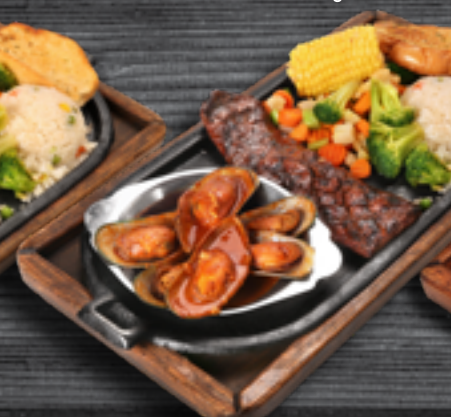
* Carne Asada Con Mejillones 39 95 Skirt steak with mussels