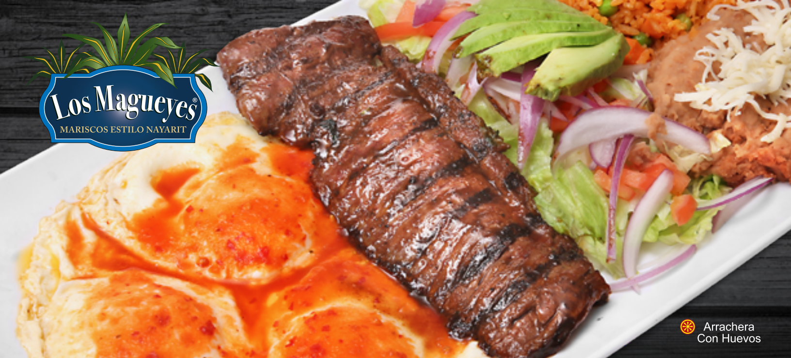
☼ Arrachera Con Huevos