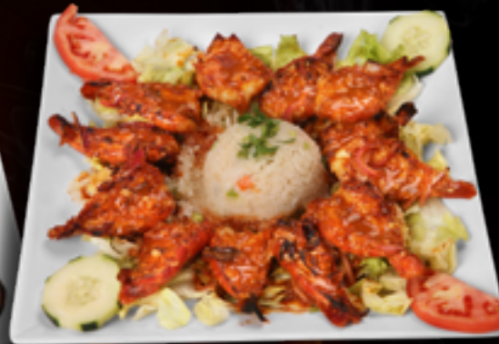
Charola de Camarones Zarandeados Sm 45 95 Lg 89 95 Grilled shrimp, choice of zarandeado sauce or garlic sauce