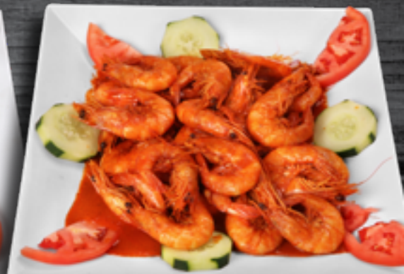
Camarones Cucarachas Deep fried shelled shrimp in our hot Huichol sauce In their shell 39 95 Peeled 45 95

* THESE ITEMS ARE COOKED TO ORDER CONSUMING RAW OR UNDERCOOKED MEATS, POULTRY, SEAFOOD, SHELLFISH, OR EGGS MAY INCREASE YOUR RISK OF FOODBORNE ILLNESS, ESPECIALLY IF YOU HAVE CERTAIN MEDICAL CONDITIONS * ESTOS PLATILLOS SON COCINADOS AL TÉRMINO DEL GUSTO DEL CLIENTE CONSUMIR CARNES, AVES, MARISCOS, O HUEVOS CRUDOS O POCO COCIDOS PUEDE AUMENTAR SU RIESGO DE ENFERMEDADES TRANSMITIDAS POR ALIMENTOS, ESPECIALMENTE SI TIENE DETERMINADAS CONDICIONES MÉDICAS