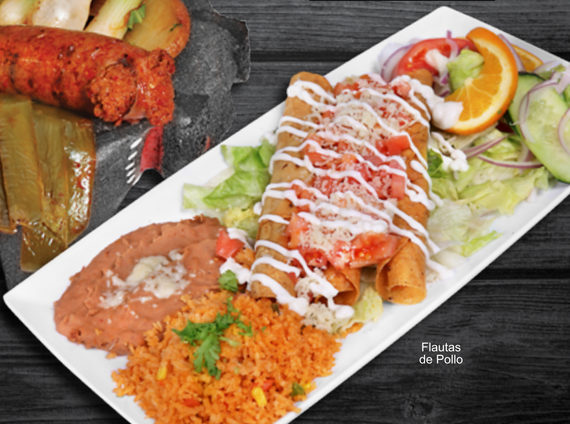
Flautas de Pollo

* THESE ITEMS ARE COOKED TO ORDER CONSUMING RAW OR UNDERCOOKED MEATS, POULTRY, SEAFOOD, SHELLFISH, OR EGGS MAY INCREASE YOUR RISK OF FOODBORNE ILLNESS, ESPECIALLY IF YOU HAVE CERTAIN MEDICAL CONDITIONS * ESTOS PLATILLOS SON COCINADOS AL TÉRMINO DEL GUSTO DEL CLIENTE CONSUMIR CARNES, AVES, MARISCOS, O HUEVOS CRUDOS O POCO COCIDOS PUEDE AUMENTAR SU RIESGO DE ENFERMEDADES TRANSMITIDAS POR ALIMENTOS, ESPECIALMENTE SI TIENE DETERMINADAS CONDICIONES MEDICAS