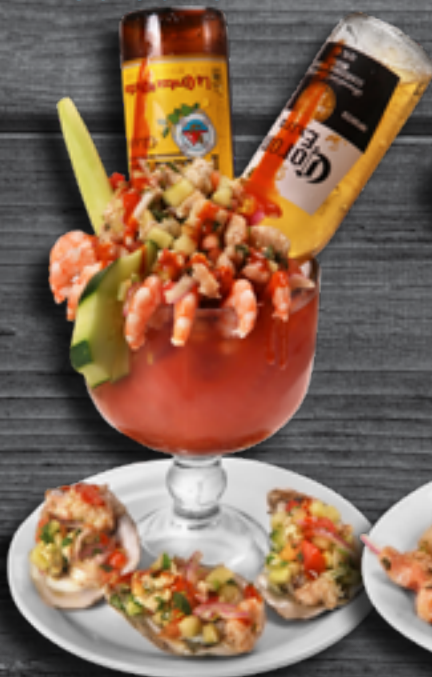
* El Señor de Los Cielos 27 95 With three raw oysters