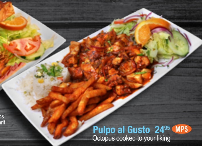
Pulpo al Gusto 24 95 MP$ Octopus cooked to your liking