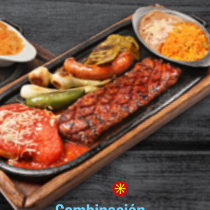
* Combinación Los Magueyes 39 95 Char-broiled steak, rice, beans, grilled jalapeño pepper, grilled onions, grilled nopal, Mexican sausage and stuffed Poblano pepper