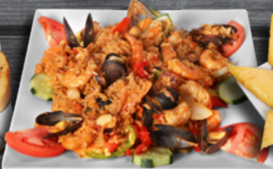
Paella 30 95 Spanish rice served with mussels, octopus, shrimp and scallops