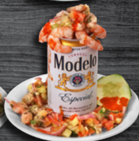
Chela Cabrona 9 95