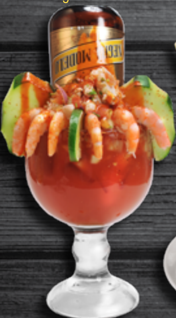
* Michelada Perra 18 95