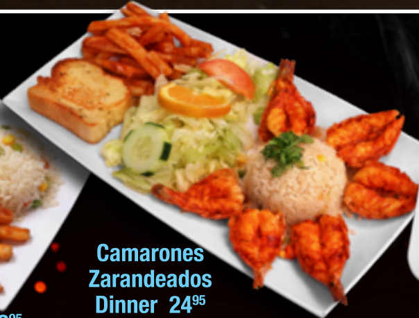
Camarones Zarandeados Dinner 24 95

Grilled shrimp, choice of zarandeado sauce or garlic sauce