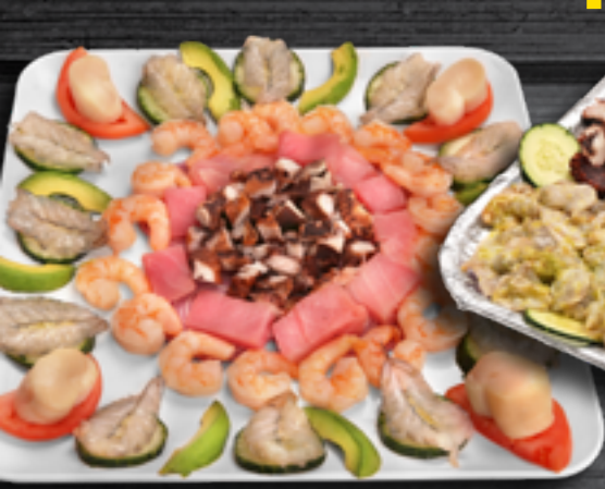
* Los Mochis Served Cold! 78 95 Octopus, raw shrimp aguachil style, scallops, tuna and boiled shrimp