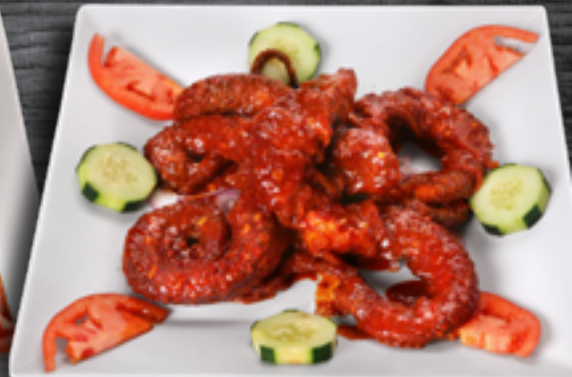
Pulpo Encabronado 41 95 MP$ Octopus stripes in a spicy guajillo and Huichol sauce