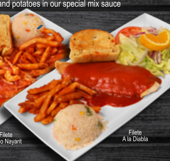
Filete A la Diabla