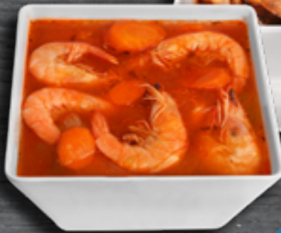
Caldo de Camaron

Seafood combination soup: shrimp, octopus, crab legs, mussels, scallops, fish, & clams