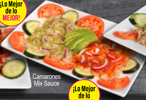
Camarones Mix Sauce