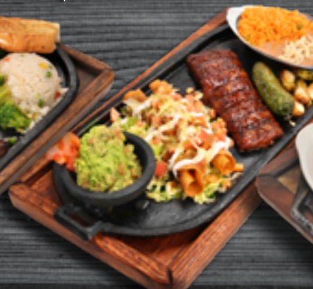
* Carne Asada Con Flautas 36 95 Skirt steak with chicken flautas