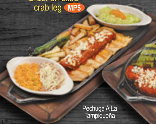
Pechuga A La Tampiqueña