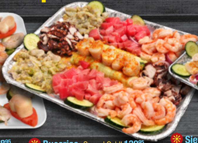
* Bucerias Served Cold! 139 95 Octopus, raw shrimp aguachil style, scallops, tuna and boiled shrimp