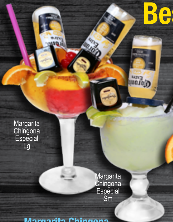
Margarita Chingona Especial Lg