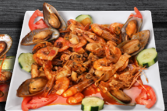
Charola del Mar Sm 44 95 Lg 79 95 MP$ Combination of prawns, mussels, shrimps, oysters, octopus, & surimi. Add one CRAB LEG for 12 95

MP$ Prices marked *MP may vary according to the current market. Los precios marcados con *MP pueden variar para ajustarse a los costos en el mercado