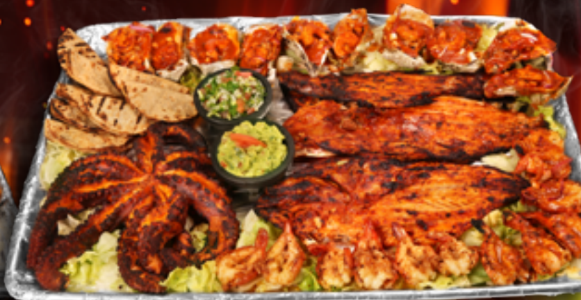
Charola Zarandeada 175 95 MP$ Octopus, red snapper, shrimp, oysters prepared with seafood mix. All grilled with our special salsa zarandeada. Bean tacos, pico de gallo and guacamole

¡DE LO MEJOR DE NUESTRAS ESPECIALIDADES!