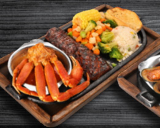
* Carne Asada Con Pata 43 95 Skirt steak with one crab leg Order an extra crab leg MP$